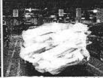
Vehicle at Subject's residence