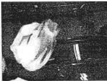
Subject exiting from his residence